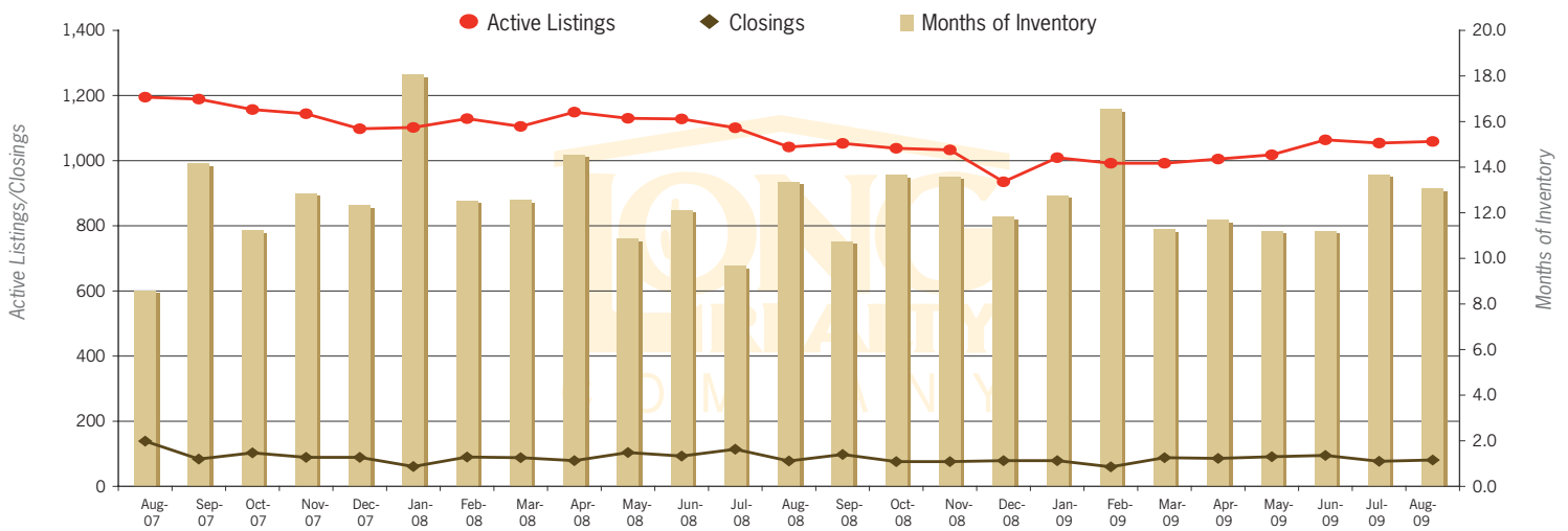
Months of Inventory, Active Listings and Closings

These statistics are based on information obtained from the Southeast Arizona MLS on 9/03/09. Information is believed to be reliable, but not guaranteed. Months of Inventory (MOI) reflect the time period required to sell all the properties on the market given the number of closed transactions in the preceding month, provided no new product becomes available. This is an excellent benchmark to show the velocity of transactions in relation to the market inventories. This measurement is a broad one and will vary (in some cases dramatically) by price range, location and type of property.